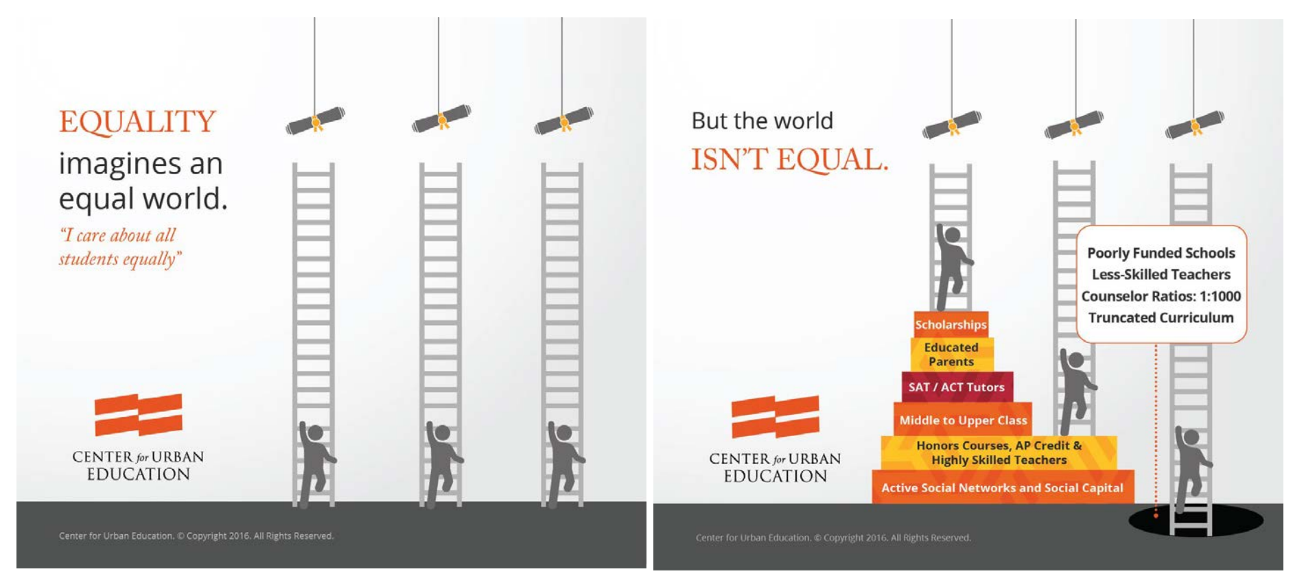
Images © <u>USC Center for Urban Education</u>. All rights reserved. This content is excluded from our Creative Commons license. For more information, see <a href="https://ocw.mit.edu/help/faq-fair-use/">https://ocw.mit.edu/help/faq-fair-use/</a>.