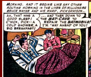
Bruce Wayne and Dick Grayson in two side by-side beds. Panel from Batman #84 (June 1954), page 24.

© National Comics Publications Inc. All rights reserved. This content is excluded from our Creative Commons license. For more information, see https://ocw.mit.edu/help/faq-fair-use/