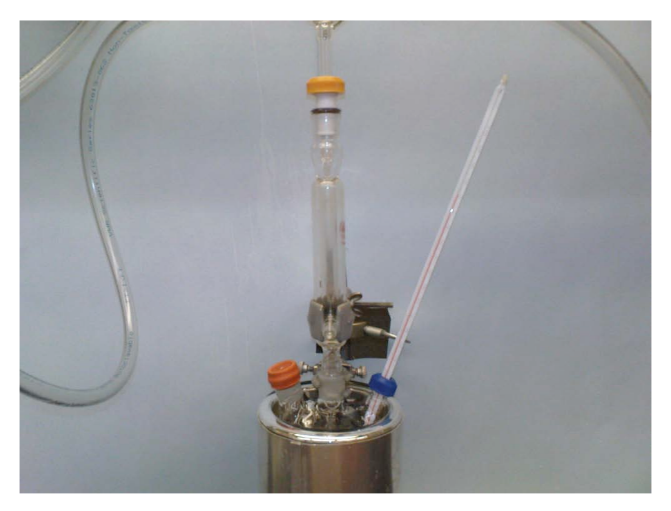
Figure 3. Set up for the in situ generation of the CAB catalyst and Diels-Alder reaction.

An oven-dried, 125-mL, tapered flask with two 14/20 ground glass necks and a thermometer inlet is equipped with a magnetic stirbar, a rubber septum in the side neck, a low-temperature thermometer, and a reflux condenser in the center neck. The condenser simply functions as a "spacer" and is not connected to a water line. The top of the condenser is fitted with an inlet adapter connected to a three-way stopcock. One branch of the stopcock is connected by tygon tubing to the nitrogen line, and the other branch to an oil bubbler to allow for the monitoring of the nitrogen flow rate. Flush the reaction flask with nitrogen for 8 min by closing the bubbler off at the three-way stopcock and venting the flask with a short syringe needle through the rubber septum as an outlet for the nitrogen. Figure 3 below shows the setup for the generation of the CAB catalyst and Diels-Alder reaction.